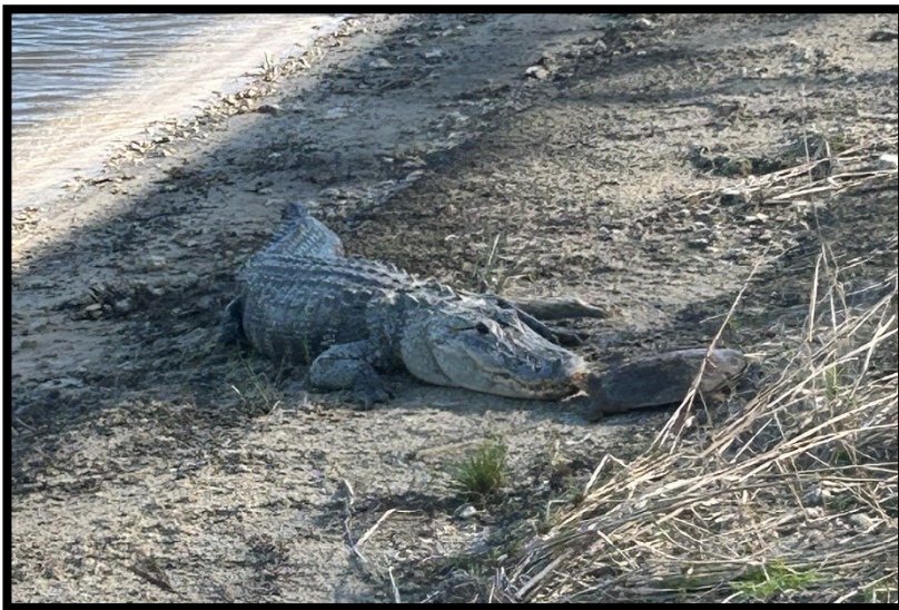
Why can't we be friends?

For those NOT voting electronically in the election, CLICK HERE for the agenda, proxy, ballot and candidate bios. Voting materials are also available at the management office. The election vote is a SECRET ballot. Your ballot must be placed in a smaller, SEALED envelope (do not place proxies inside the sealed ballot envelope). The sealed ballot envelope is then placed in a larger sealed envelope with your proxy. Your address and signature are written on the outer envelope only.