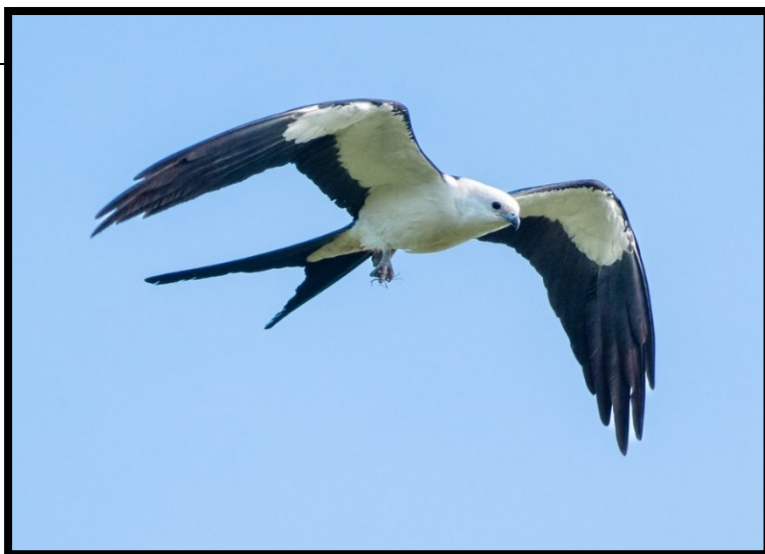
Swallow-Tailed Kite in Flight