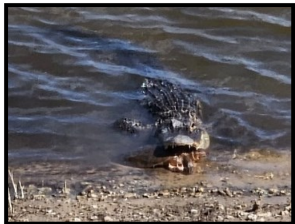
Snack Shack